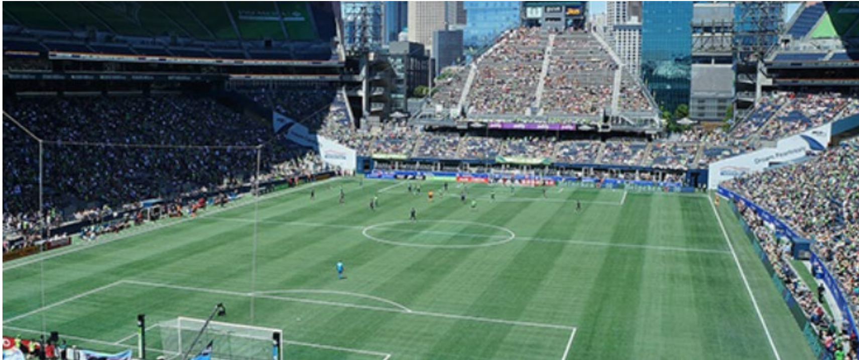
Lumen Field, known as Seattle Stadium for the FIFA World Cup 26™