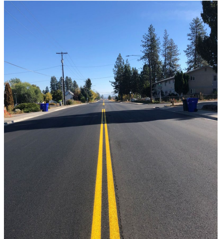
Crawford Ave Preservation, Deer Park