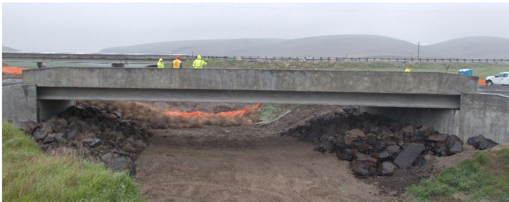
Arch Bridge on Lamar Road, Walla Walla County