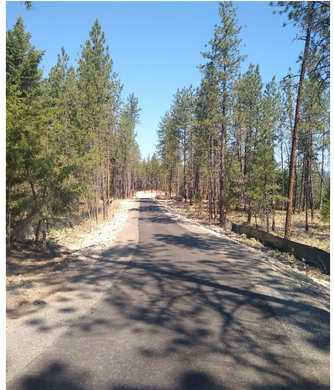
Little Spokane Connection, Spokane County