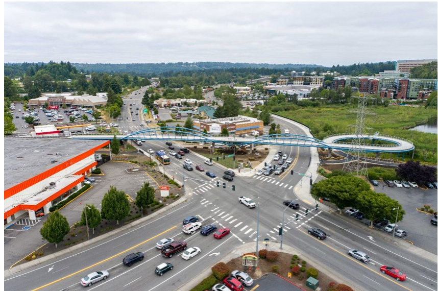
124 th Ave NE Pedestrian Bridge, Kirkland