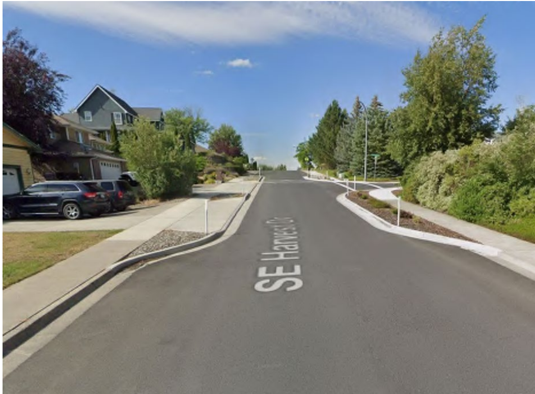
Arterial Street Repaving, SE Harvest Drive, City of Pullman