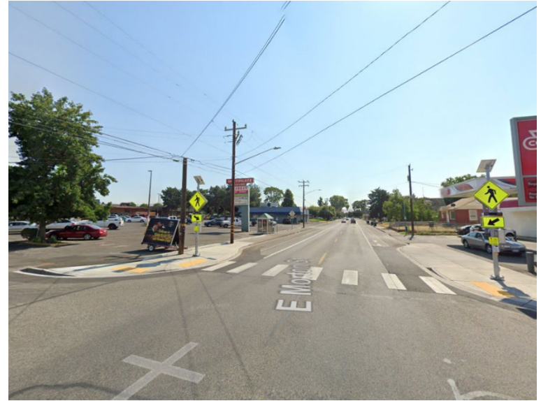
Citywide Pedestrian Treatments, Walla Walla