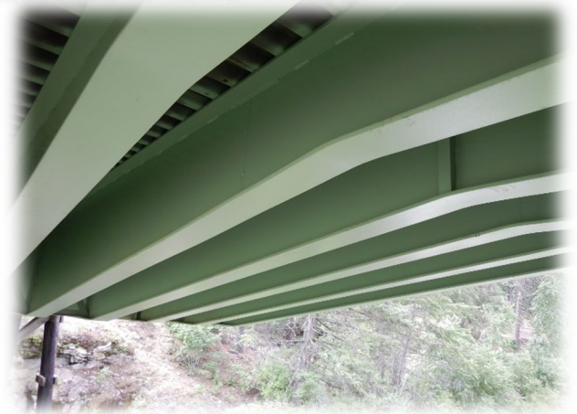
Boulder Creek Bridge – Ferry County