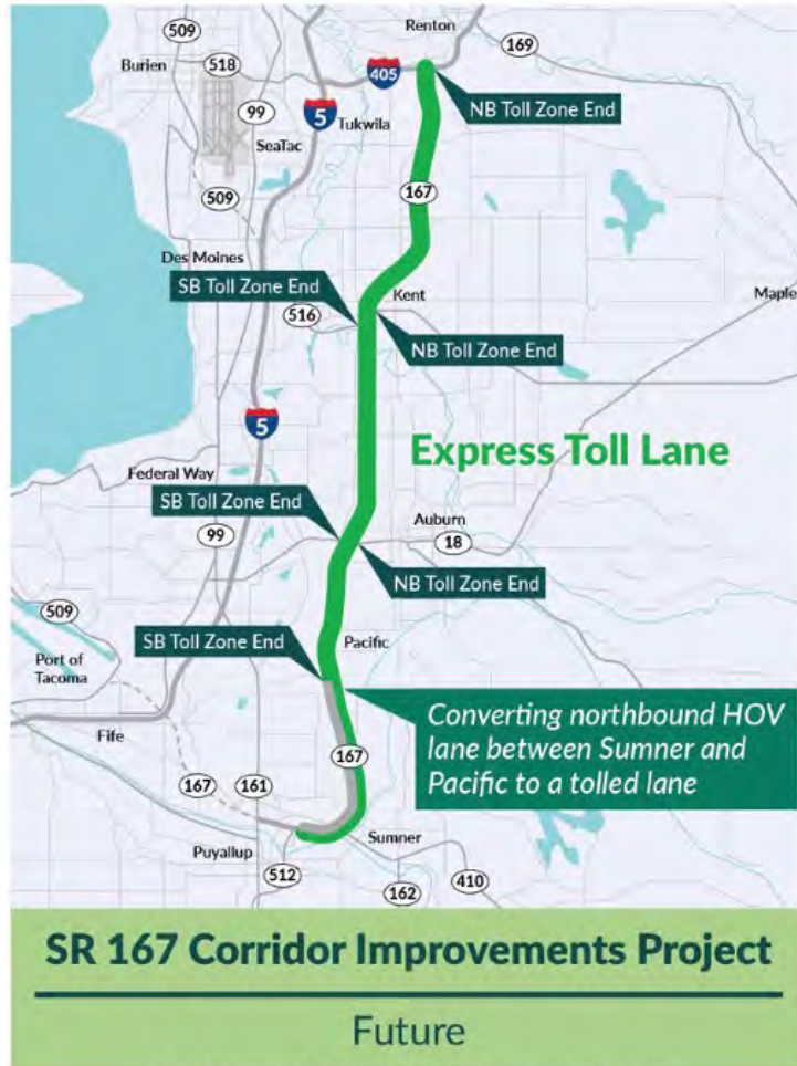
Map of future SR 167 express toll lanes corridor