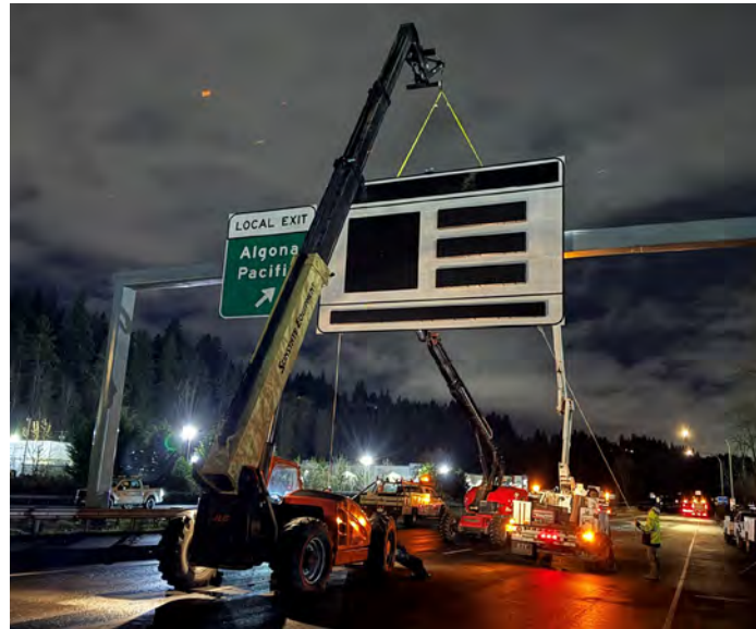
New toll sign installation for destination pricing