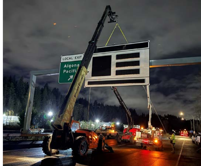
New toll sign installation