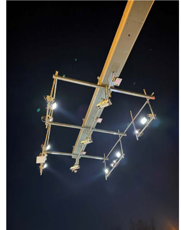
New toll equipment installation