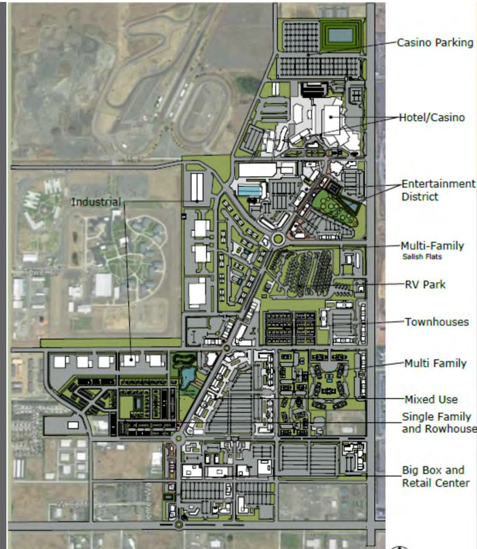
Northern Quest Community