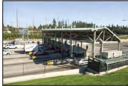
Attended Booth Lanes