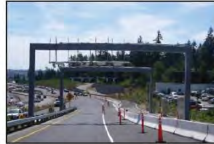
Ramp ORT Lane