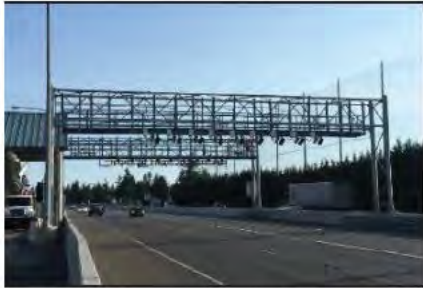
Mainline ORT Lanes