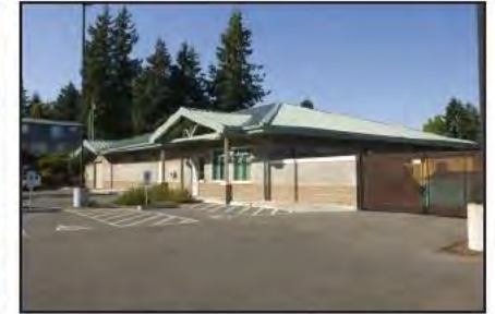
Plaza Admin. Building