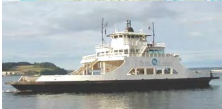
Pierce County Anderson & Ketron Island Ferries