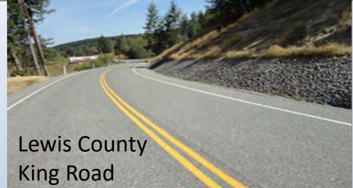
Lewis County King Road