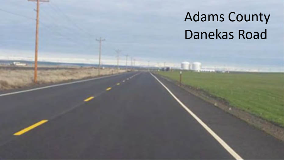
Adams County Danekas Road