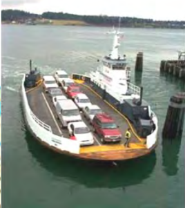
Skagit County Guemes Island Ferry