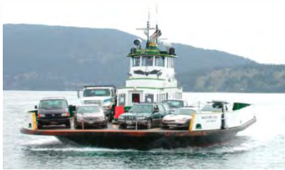
Whatcom County Lummi Island Ferry