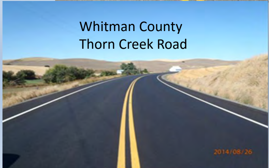
Whitman County Thorn Creek Road