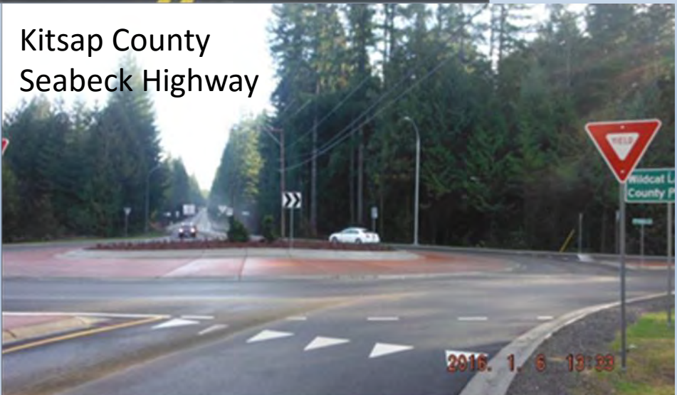
Kitsap County Seabeck Highway