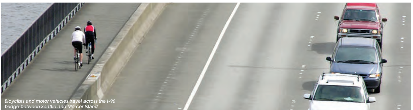
Bicyclists and motor vehicles travel across the I-90 bridge between Seattle and Mercer Island

The WSTC proposal meets a significant portion of the maintenance and preservation needs for cities, counties and the state, provides a pathway to completing many large capital projects, provides new state revenue for transit, and includes accountability measures to ensure that new dollars are spent effectively and efficiently. However, this proposal does not address all the funding needs identified in the Connecting Washington report.