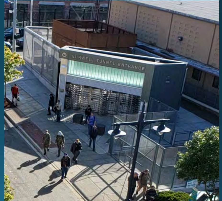
New Burwell Tunnel Entrance – partially funded by $1.3M State Commerce Grant

City pursuing an NBK-Bremerton commuter study to quantify issues and needs. Will need implementation funding