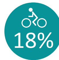
Access & Livability