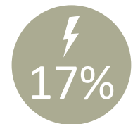
Utilities & Controls