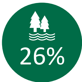
Environment & Water

Greenroads Rating System is internationally recognized as the best tool for measuring and certifying sustainability performance for transportation infrastructure. The points-based system draws from five core areas: